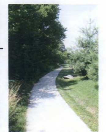
Proposed Concrete Trail Six foot wide walk Note: Trail on Lake Dam is not subject to washing or erosion and will remain gravel