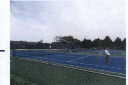
Lighting Last Four Tennis Courts